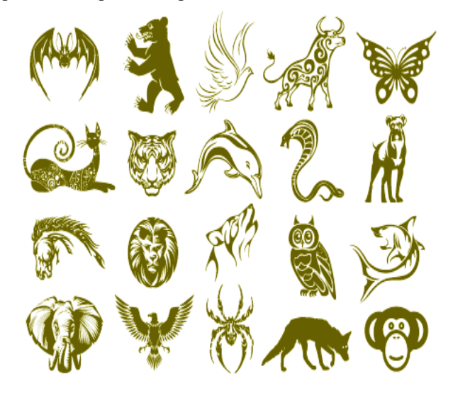
Fig 3: Input CaRP

The result of this proposed method is to give more concentration on security. As explained in the previous here the user will get more secured process for their authentication.T he figure 3 shows the input image for the methodology of this proposed system. That image is call as aCaRP as input. The beginning part of the result is shown in the figure 4 that is the process for the registration and login attempts. For the registration and login attempts process is explained in previous section